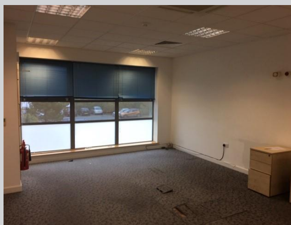
First floor front office