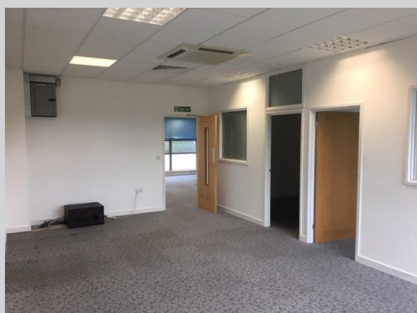
First floor rear

The premises comprise a two-storey self contained office building constructed in 2006 within a terrace of four similar units. The high quality, accommodation is mainly open plan with some demountable partitioning forming offices and a meeting room, with a tea point.